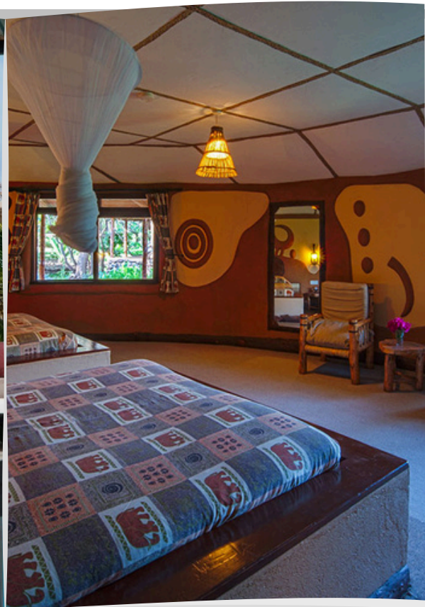
Amboseli Sopa Lodge