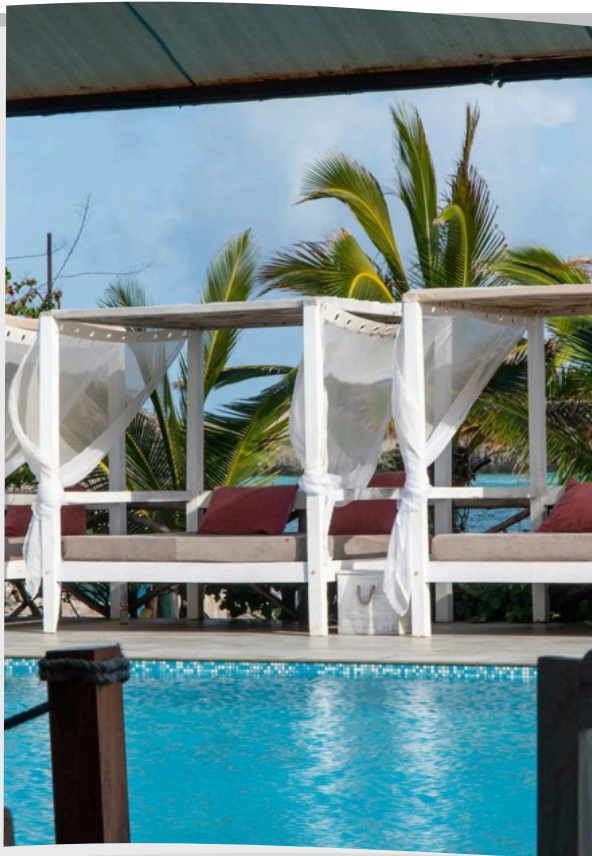
Visiwa Resort Watamu