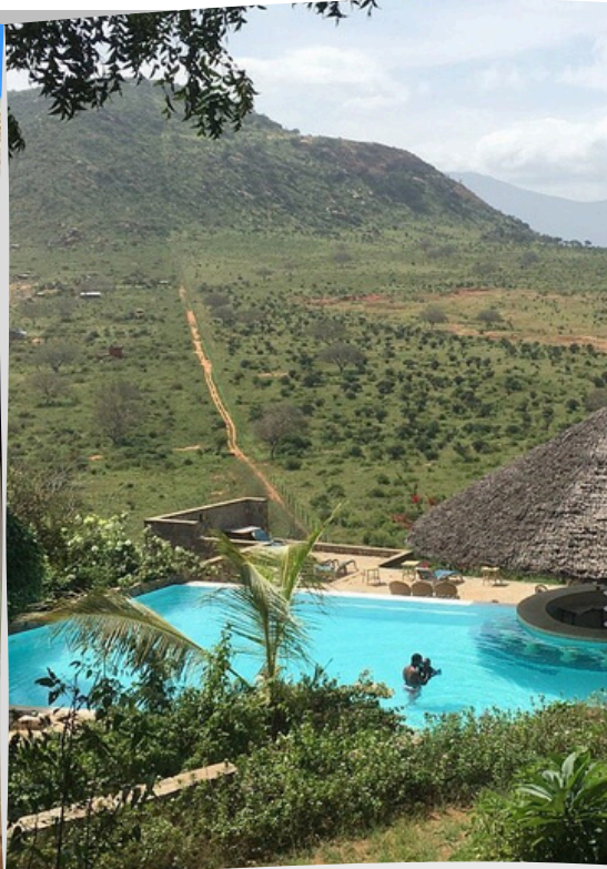
Lion Hill Lodge