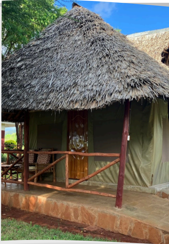
Lake Jipe Camp