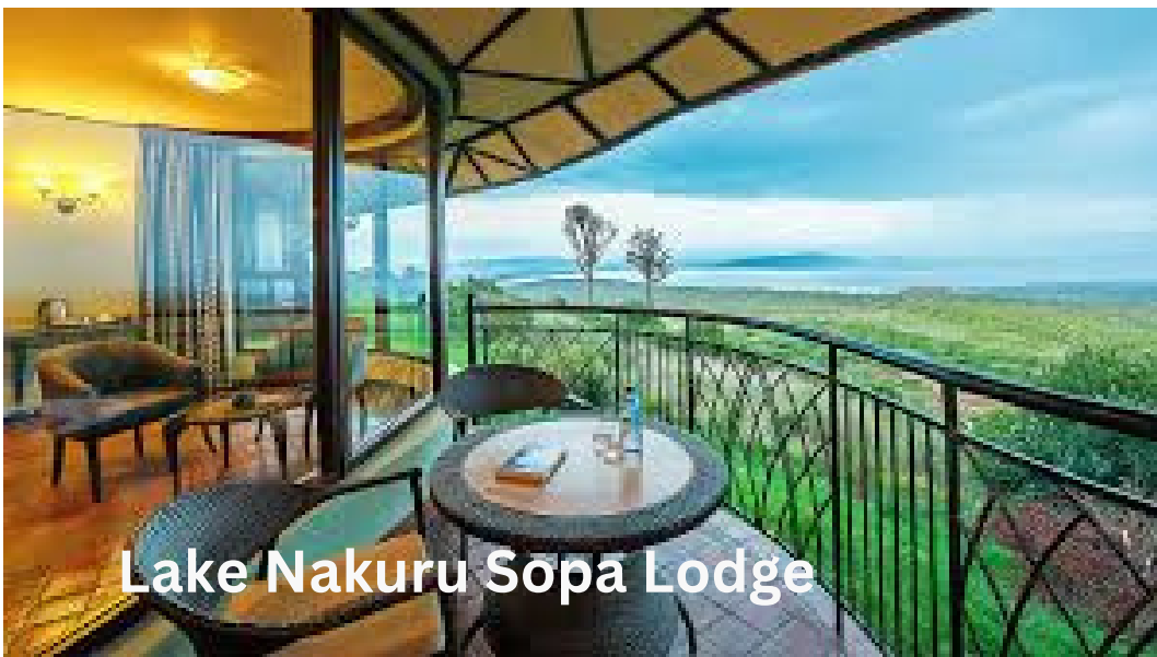
Lake Nakuru Sopa Lodge